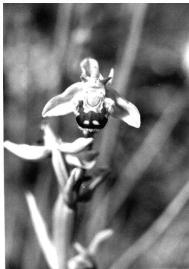
Fig. 2. Ophrys apifera Hudson.